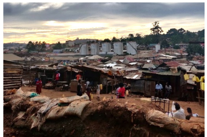
Photo showing the RoW in the Katoogo zone

The Kampala-Jinja Expressway is one of five infrastructural development mega-projects that are expected to spur socioeconomic transformation. It is a proposed 95-kilometre,