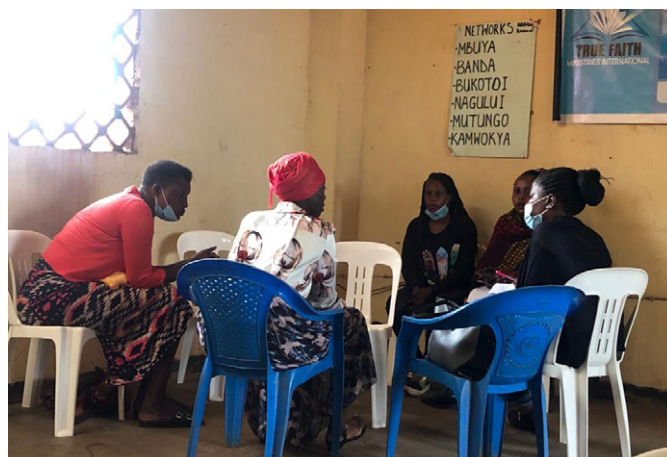
FGD with women in the RoW

The fieldwork was carried out in the Kinawataka settlement. We employed a qualitative approach to understand the differentiated involvement and experiences of women in the RoW of the KJE. The fieldwork consisted of participant observations and informal, semi-structured interviews with seven key informants. Six focus group discussions (FGDs) with women and one FGD with men were conducted. The interview sample was a purposive sample, that is, we selected respondents who were in the RoW. The main purpose of these interviews was to understand the lived experiences of the relocation process, as well as to gather information about people's situation before displacement. The interviewees ranged from landlords, tenants, business owners, community