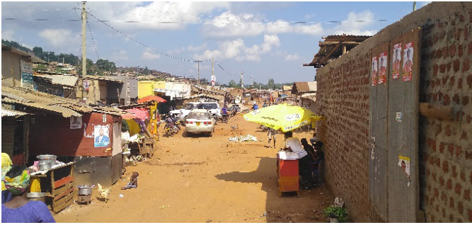
Photo showing where the RoW will pass.

bathroom to their house, carry out repairs and so on. People still lack adequate information about the KJE project in terms of the exact proposed boundaries of the highway and when they are likely to be compensated.