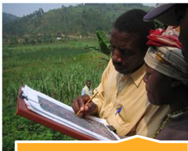
Land reg. and adm.