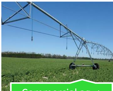
Commercial ag. + infrastructure